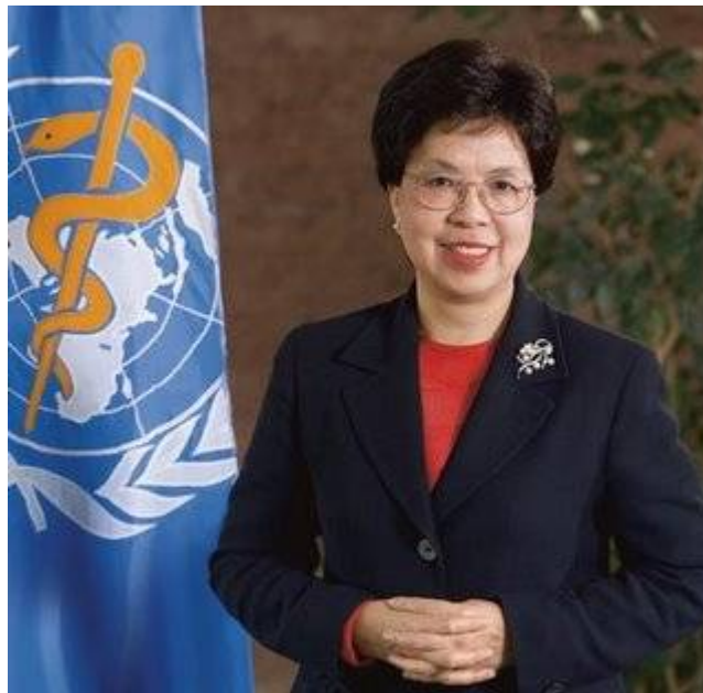
Margaret Chan with appropriate logo

Margaret Chan, the WHO Director General, declared a swine flu pandemic when there wasn't one so these emergency powers would be activated and this lackey of the Rothschild-Rockefeller cabal is going to be recommending compulsory vaccination. She's virtually done it already. The WHO advisory board on vaccination policy includes executives from ... Baxter, Novartis, GSK and Sanofi Pasteur.